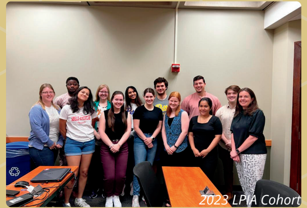
2023 LPIA Cohort

During the program, students completed their own leadership analyses on an international leader of their choosing, learning how to analyze leaders from afar and consider strategies for dealing with them. 90 students have completed the LPIA to date, and many have reported personal and professional benefits in international leadership.